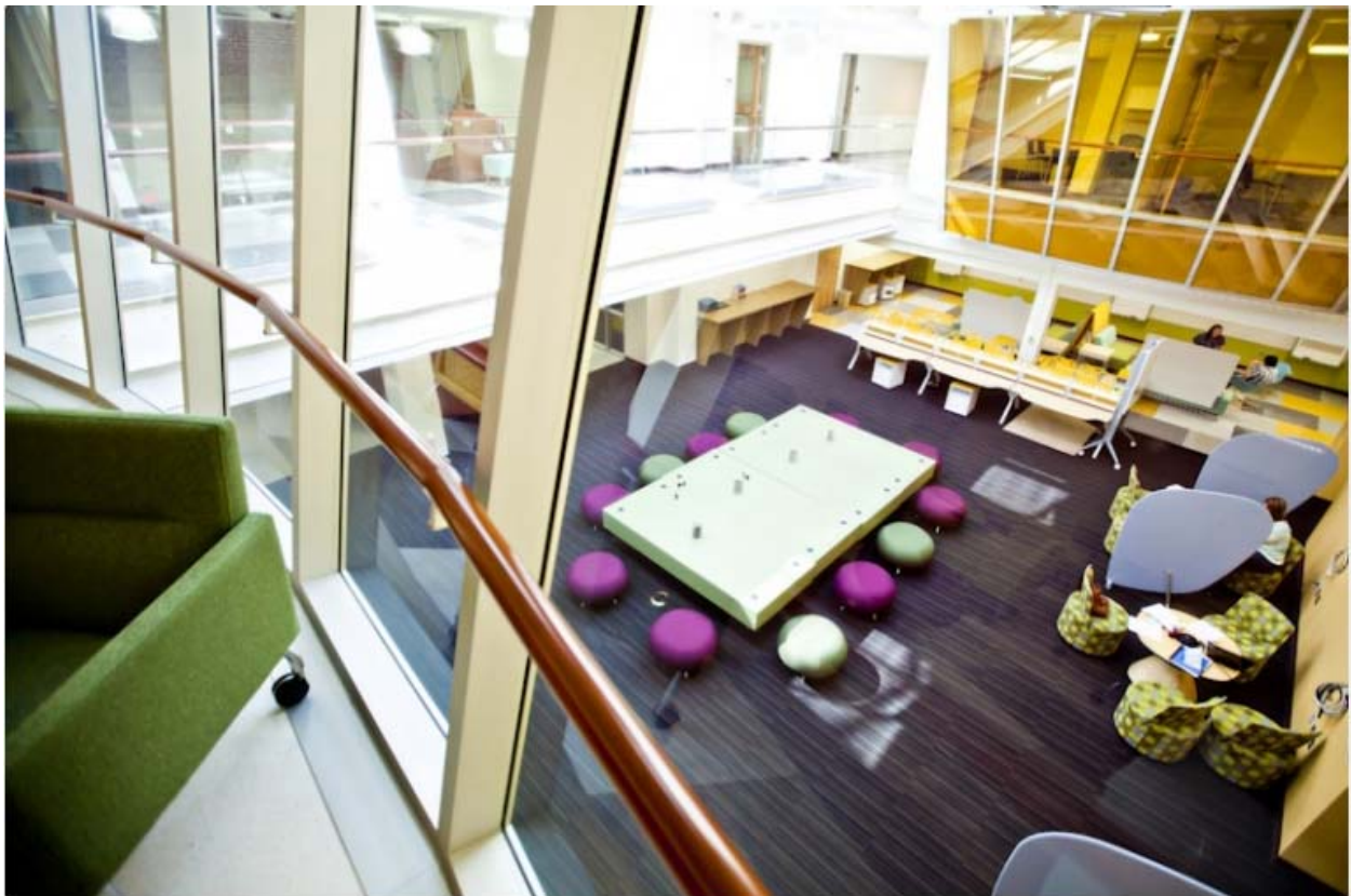
Noel Studio, Center for Academic Creativity